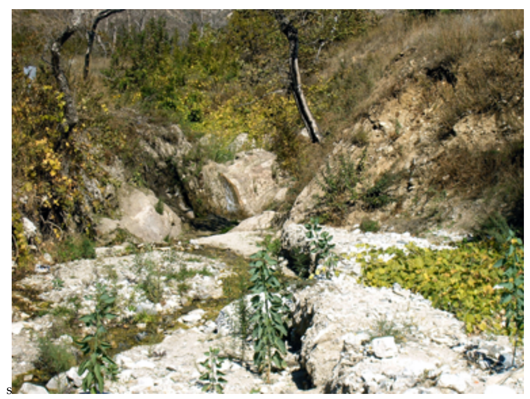
Photo 4. Drainage with walnut trees (in the distance) and herbaceous growth.